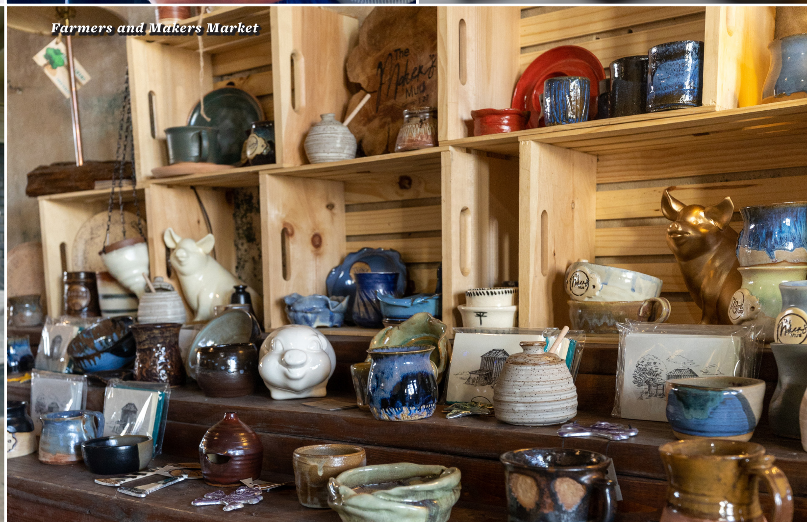
Farmers and Makers Market