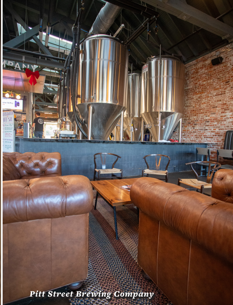
Pitt Street Brewing Company