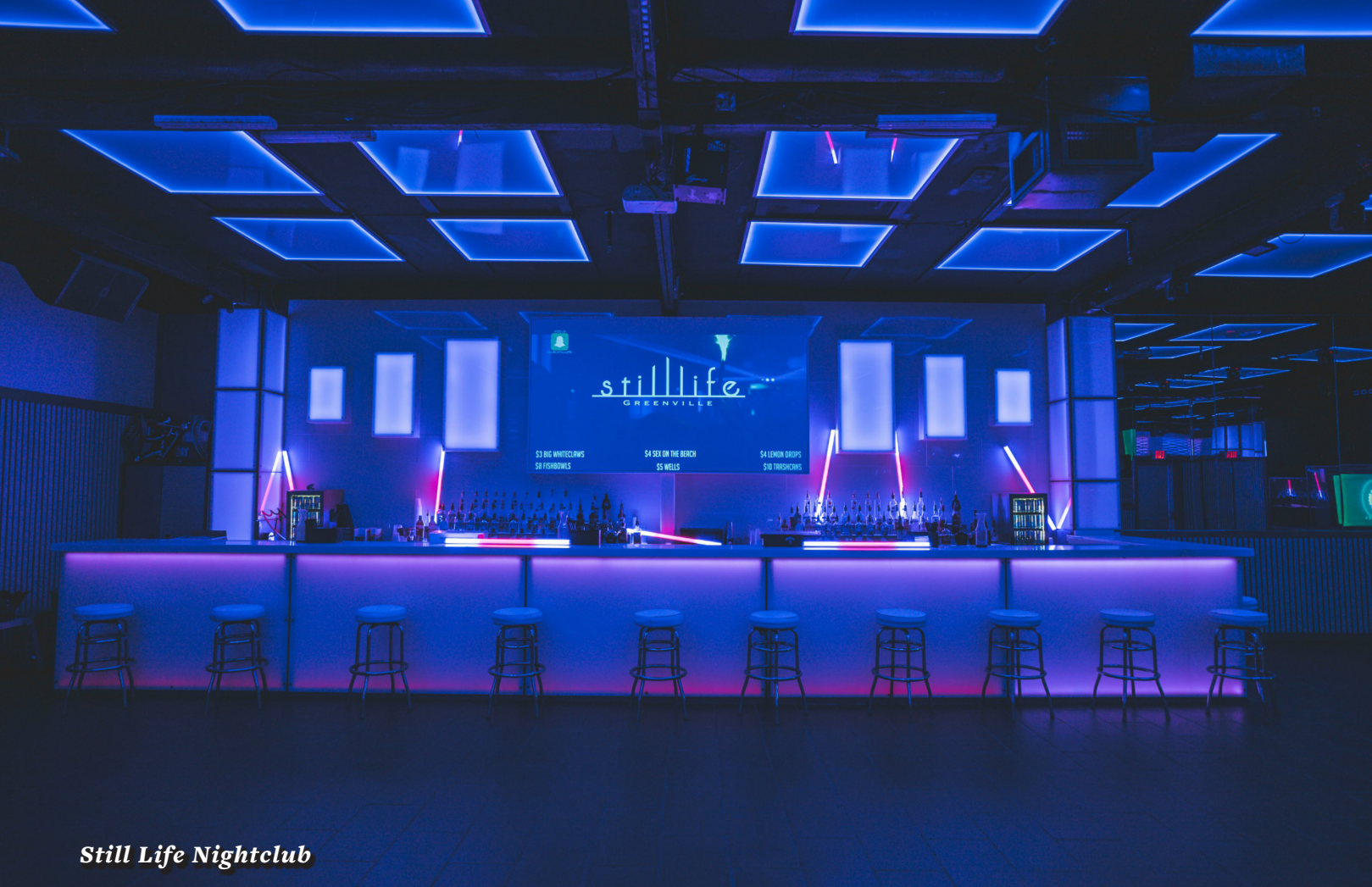
Still Life Nightclub