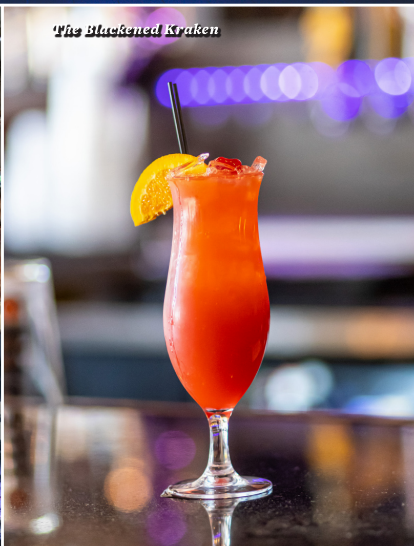
The Blackened Kraken