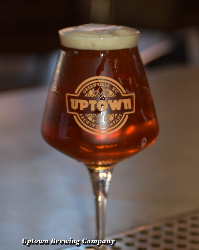
Uptown Brewing Company