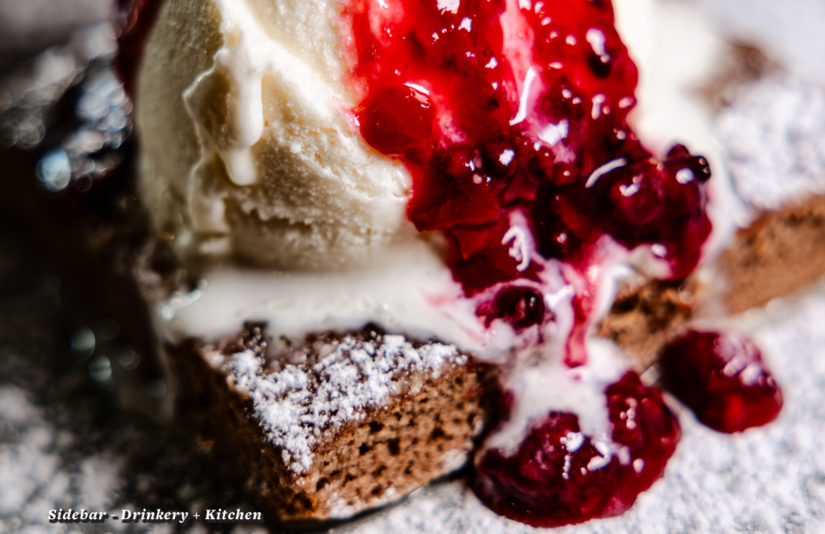
Sidebar - Drinkery + Kitchen