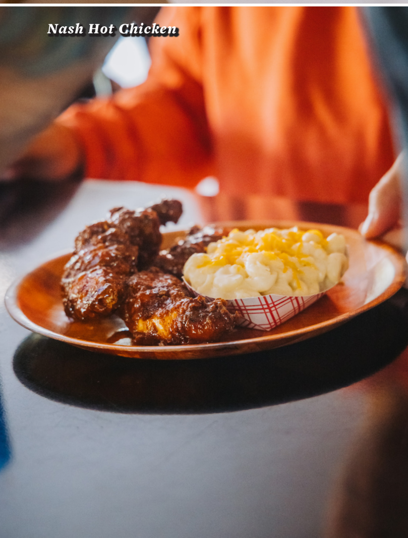
Nash Hot Chicken