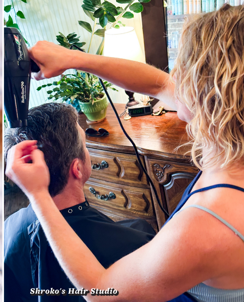
Shroko's Hair Studio