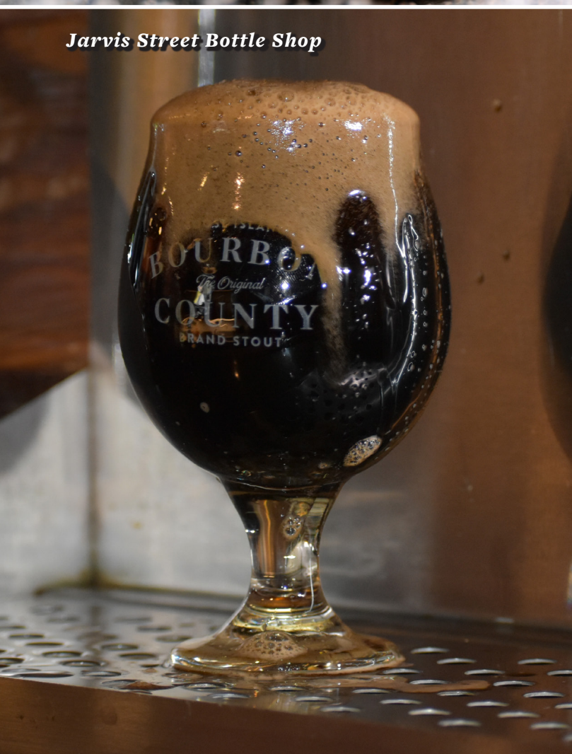
Jarvis Street Bottle Shop