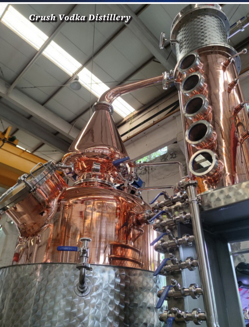
Crush Vodka Distillery