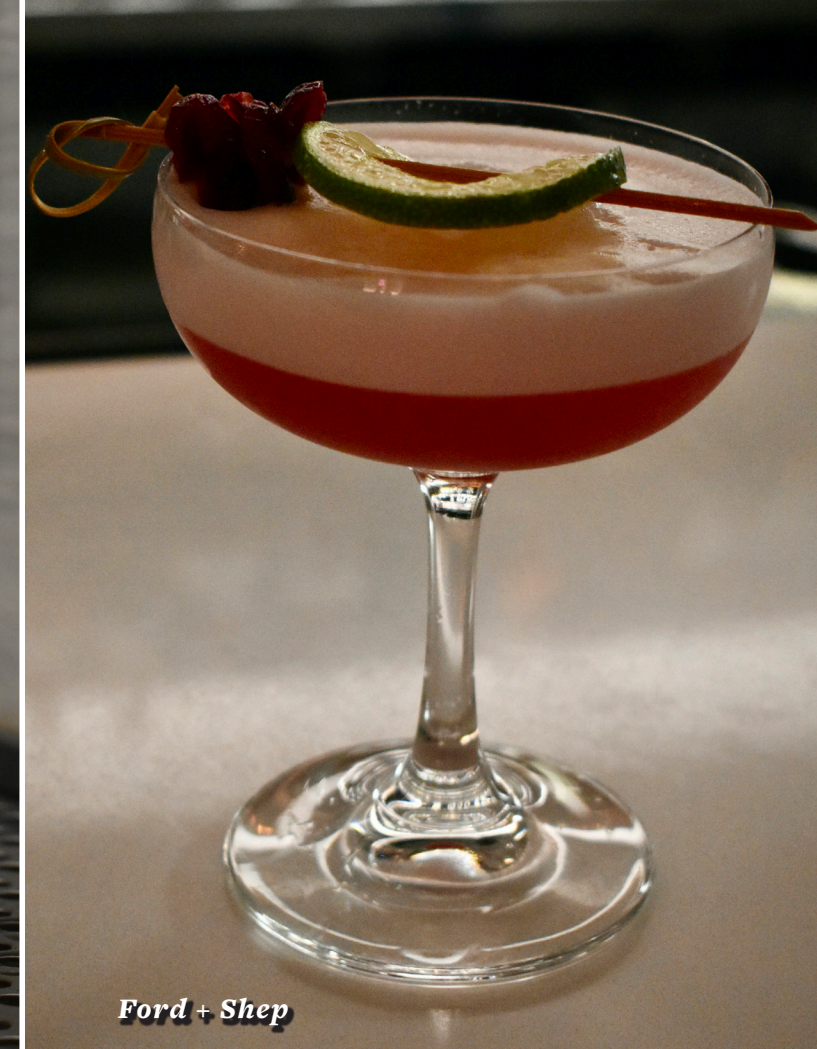
Ford + Shep