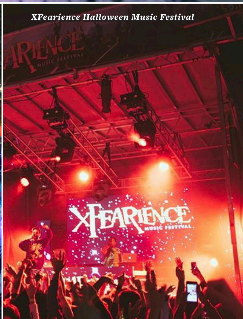
XFearience Halloween Music Festival