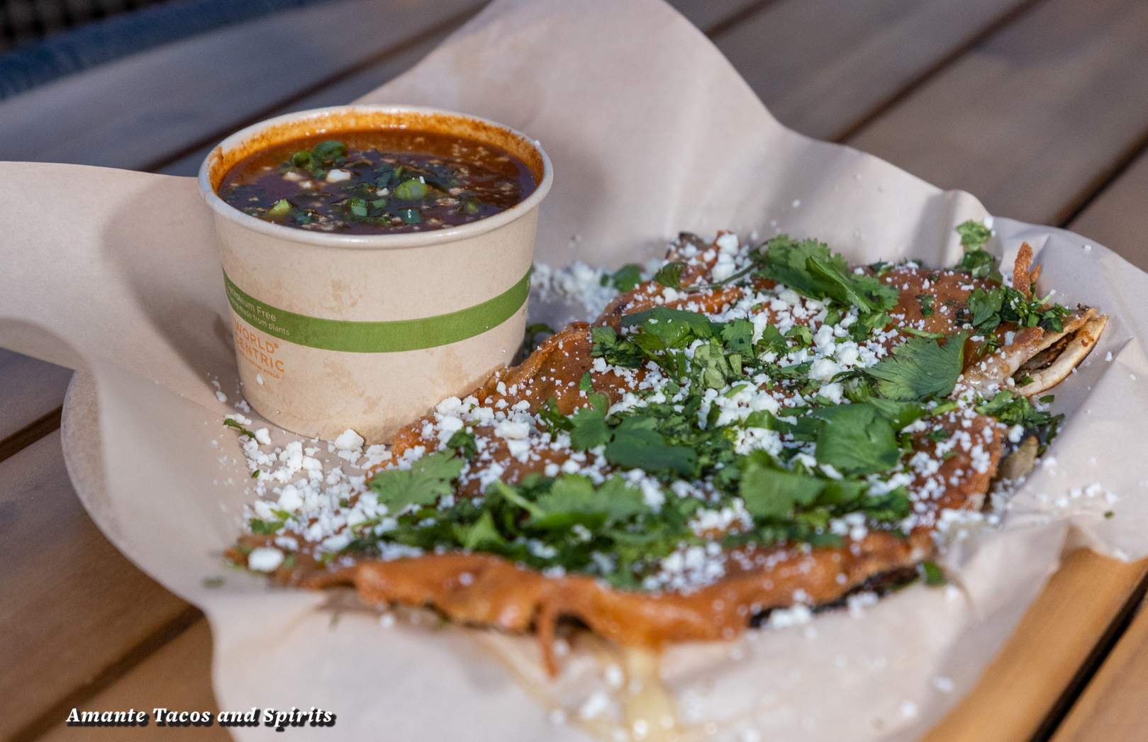
Amante Tacos and Spirits