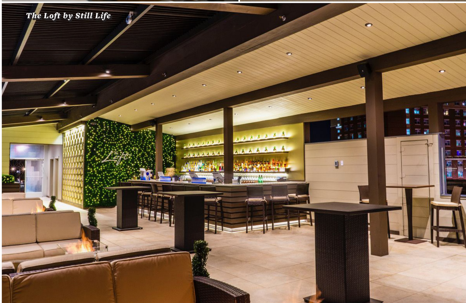
The Loft by Still Life