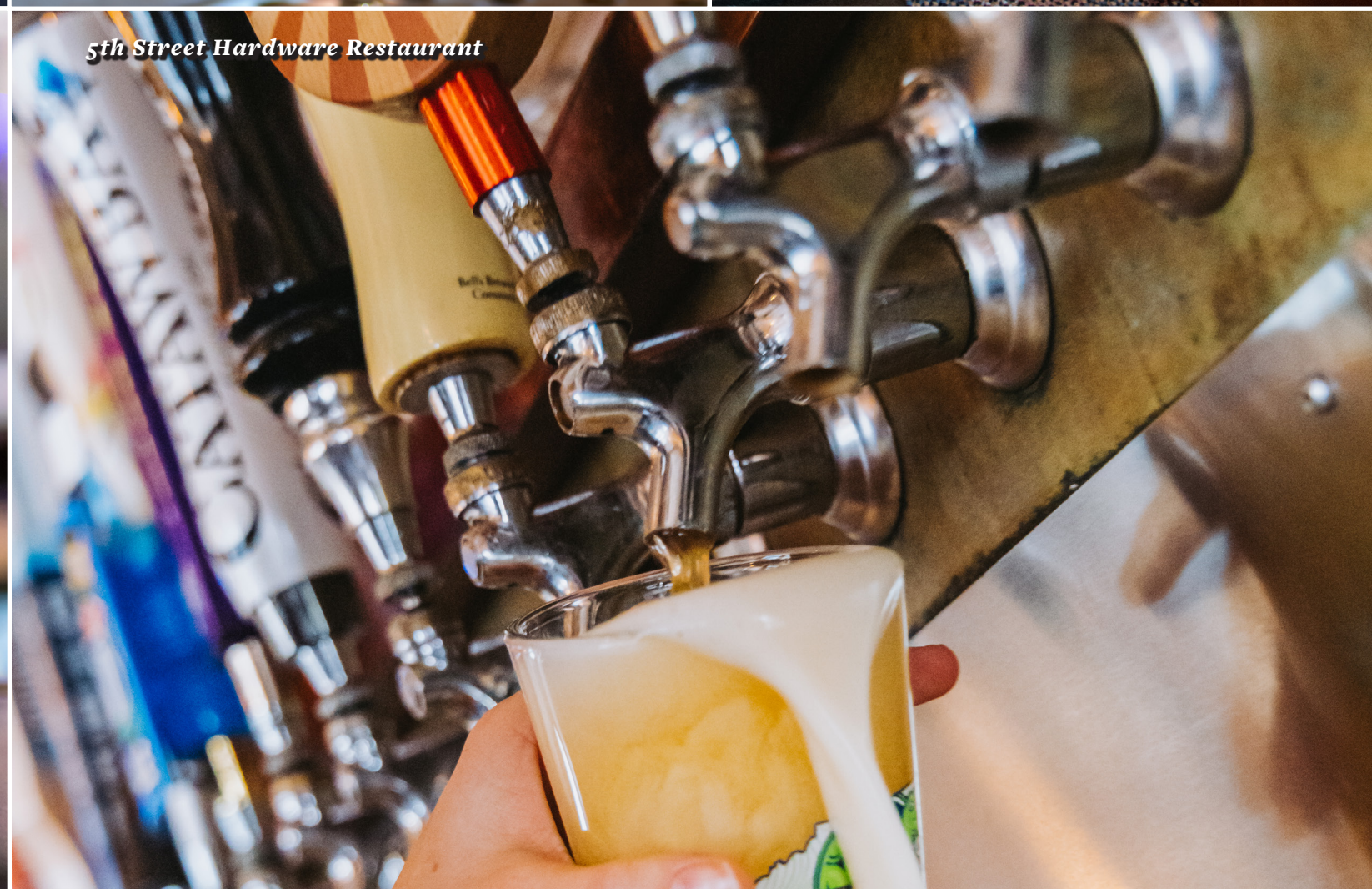
5th Street Hardware Restaurant