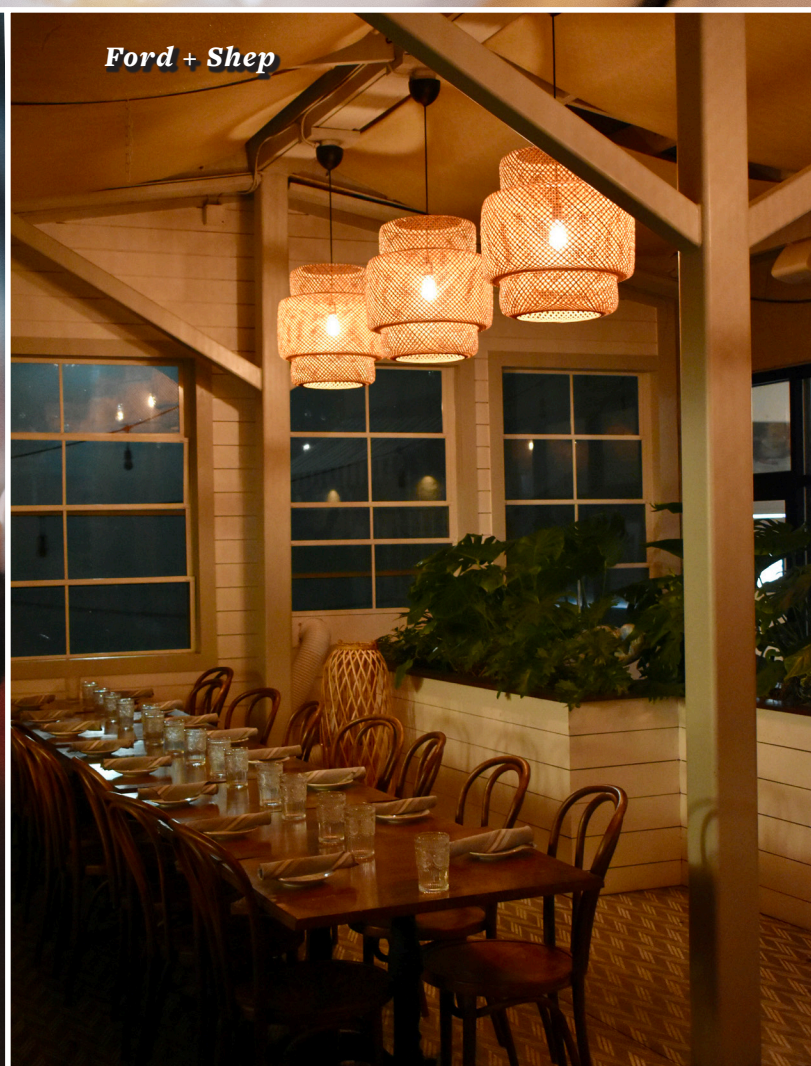
Ford + Shep