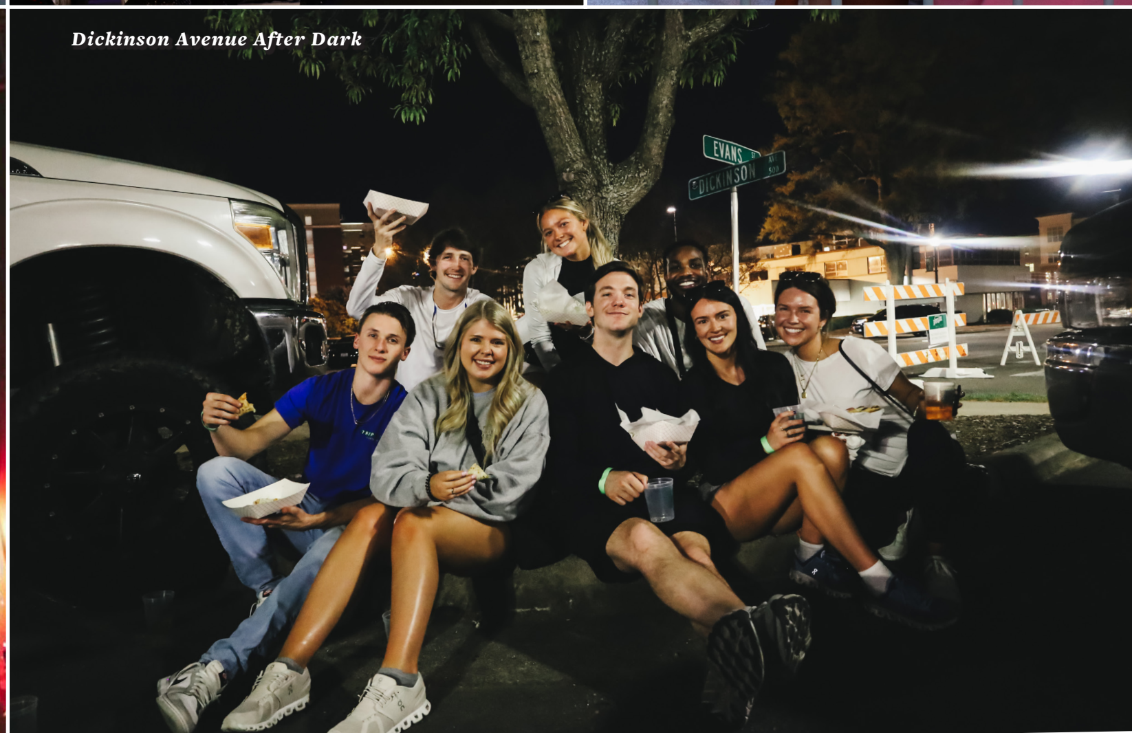
Dickinson Avenue After Dark